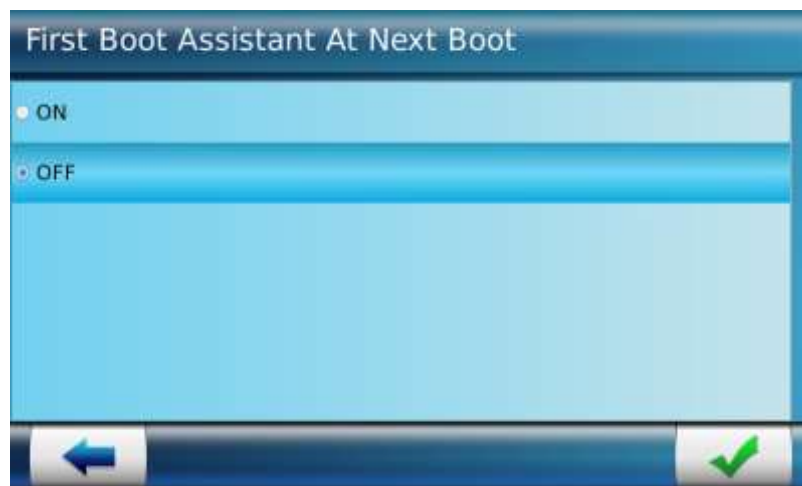
Figure 1: First Boot Assistance At Next Boot